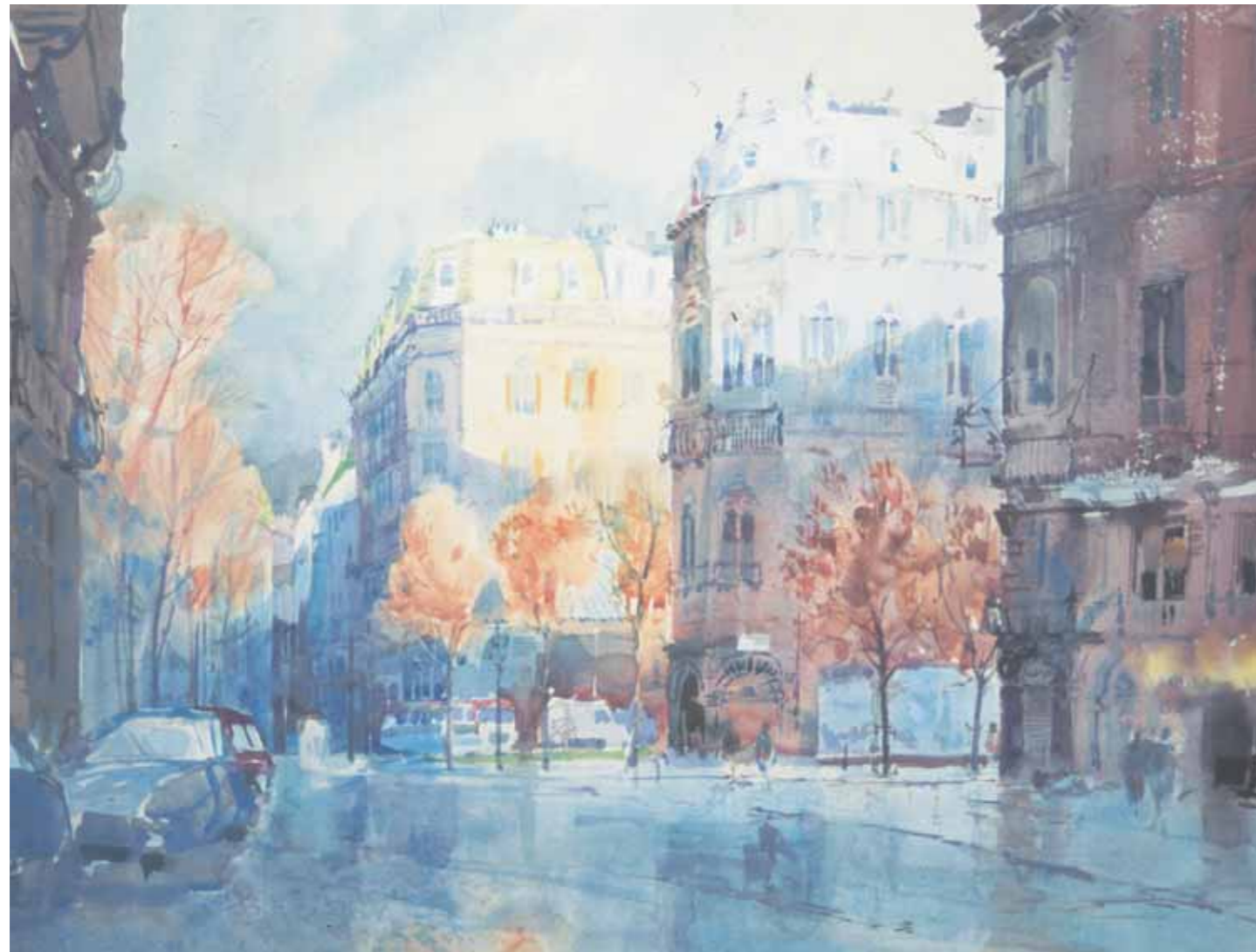
Late Afternoon, Paris, 51 x 61 cm (20 x 24 in)

foreground, reflected from the trees in the centre of the picture, is crucial in bringing it forward. It also adds to the trick the faint perspective lines are playing in taking the eye towards the centre of the picture.